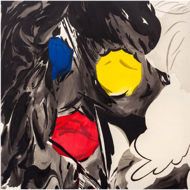
Piotr Makowski, Kompozycja NM-02 , 2017. Inks on canvas, 200 × 200 cm (78 3/4 × 78 3/4 inches).

Antoine Levi presents a series vigorous compositions by Piotr Makowski (Gdynia, Poland, 1985).