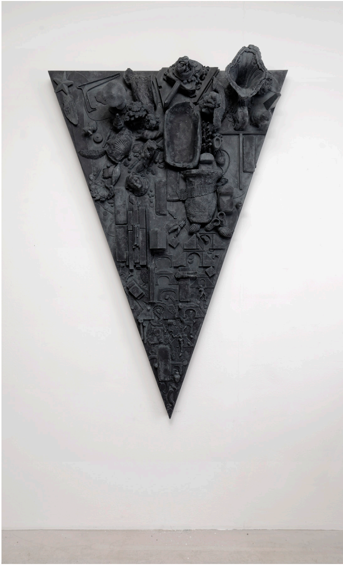
Isabelle Cornaro, Homonymes IV (grey) , 2015. Tainted Acrystal cast. 120 × 180 × 28 cm / 47 2/8 × 70 7/8 × 11 inches

Balice-Hertling gallery presents Homonyms , a series of triangular reliefs by Isabelle Cornaro.