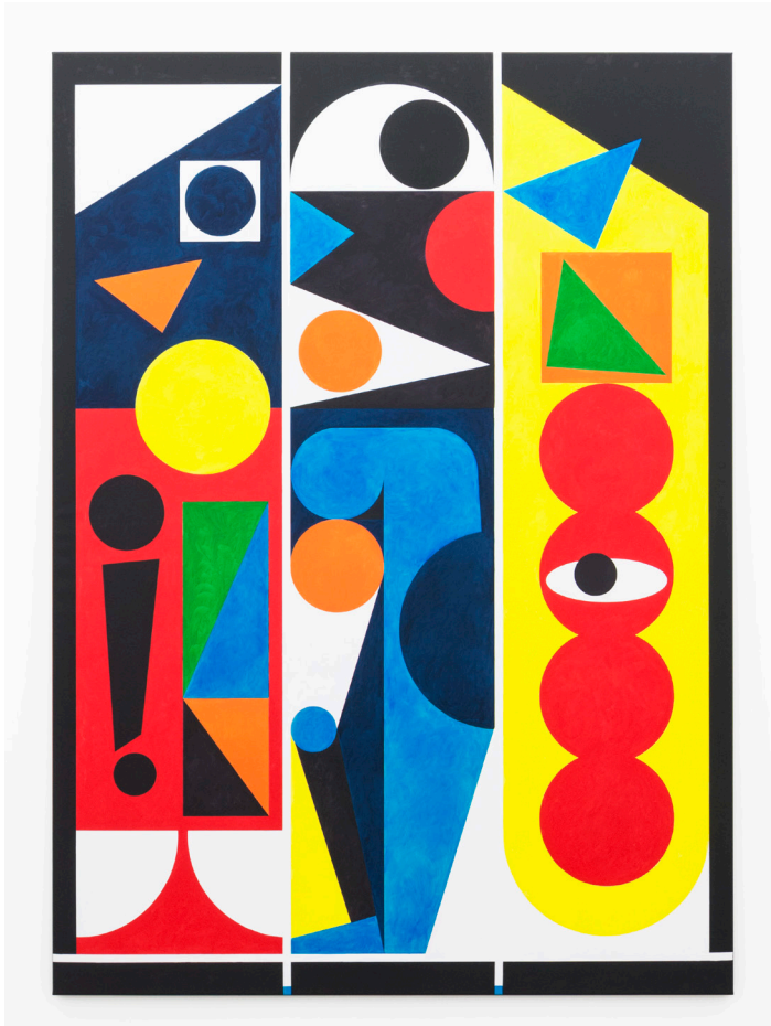
Ad Minoliti, Cyber Furies , 2020. Acrylic on canvas, 180 × 130 cm.

Crèvecoeur presents a selection of works by Ad Minoliti (born in 1981).