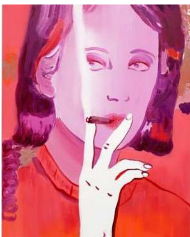
Françoise Pérovitch, George Sand , 2023, oil on canvas, 91 x 73 cm © Adagp, Paris, 2023