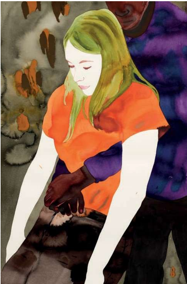
Françoise Petrovitch, Untitled , 2022, ink wash on paper, 120 x 80 cm © A.Mole © Courtesy Galerie Semiose, © Adagp, Paris 2023

PREVIEW TUESDAY, 4TH APRIL 2023: PRESS 09:30 -13:00