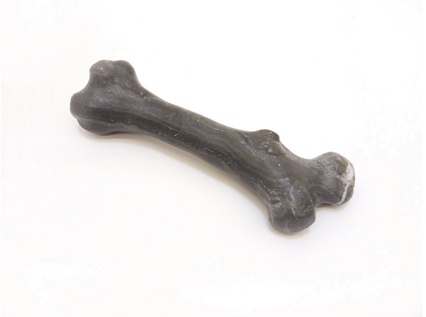
Laurent Le Deunff Os, 2010 Alabaster 14 x 1,2 x 4,5 cm unique artwork INV Nbr. LLD-10-003