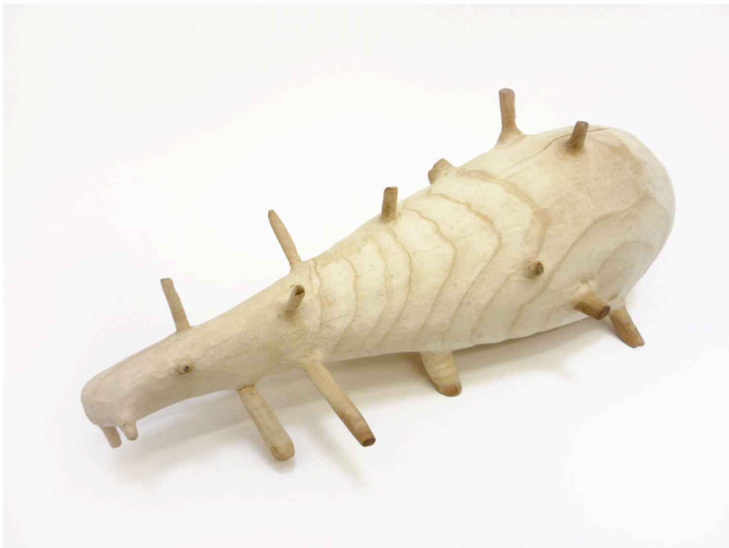
Laurent Le Deunff Massue, 2010 pine 50 x 20 x 20 cm unique artwork INV Nbr. LLD-10-005